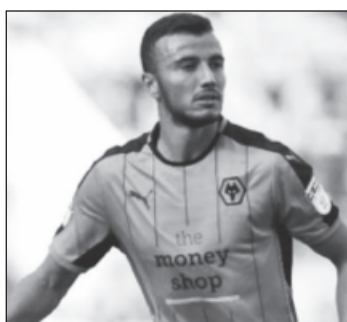
Romain Saiss 30th August 2016

The Moroccan international midfielder arrived from Ligue 1 side Angers on a four-year-deal.