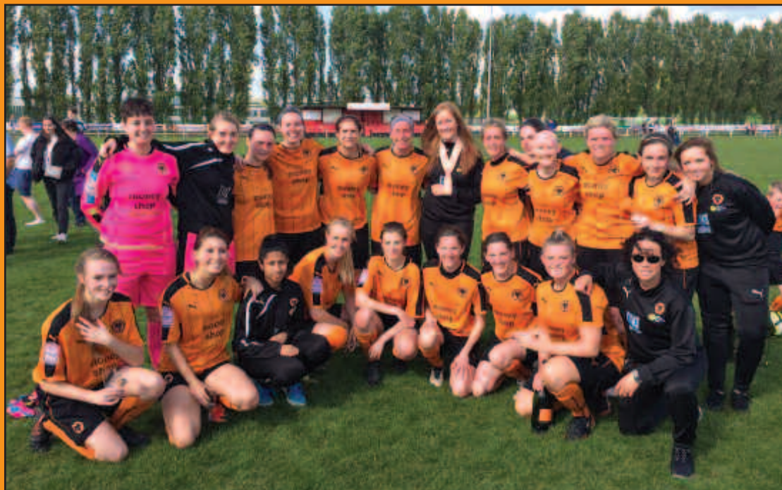
“WOLVES WOMEN CHAMPIONS” SPONSORED BY LONDON WOLVES