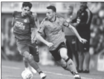
Diogo Jota 25th July 2017