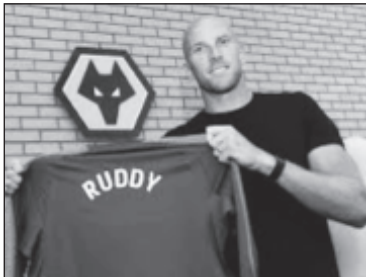
John Ruddy 10th July 2017

The 26-year-old French centre half moved to Molineux on a season-long loan deal from Porto. He became the second player to swap Porto for Wolves on the same day as the stunning £15m club record capture of Ruben Neves.