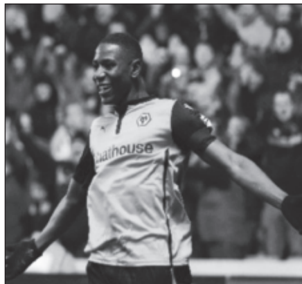
Benik Afobe 31st January 2018

During the last day of the transfer window rumours were rife that Benik Afobe was on his way back to Wolves. However, as the transfer deadline reached its conclusion it seemed that the deal was dead and buried, a stalemate had ensued with Wolves unwilling to either buy Afobe permanently, or agree to a permanent deal at the end of a loan spell. But with half an hour to the end of the window Bournemouth caved in to Wolves demands and agreed to a loan deal worth to be in the region of £1 million.